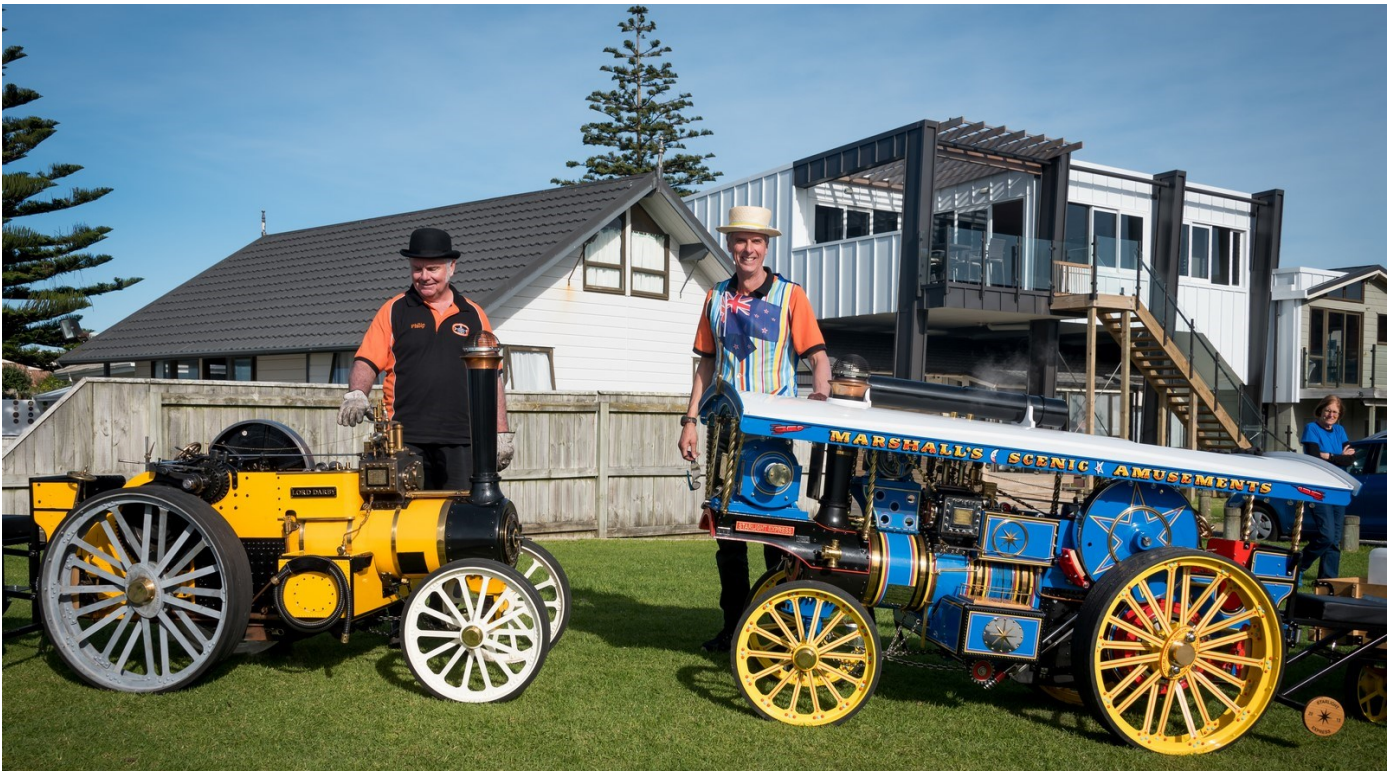
Queen's Birthday Weekend Waihi Beach