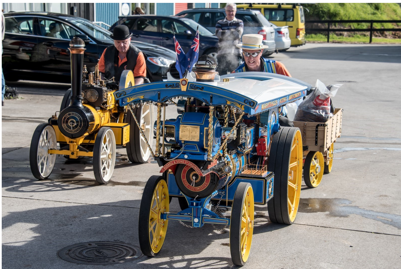
Below : Just leaving the assembly point.